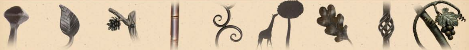
Old World Leaf Pine Bamboo Scroll Shapes Oak Basketweave Fruit

Motifs - These are central elements that drive styling. How they are employed will determine the theme, helping the piece to become rustic, contemporary, elegant or casual.