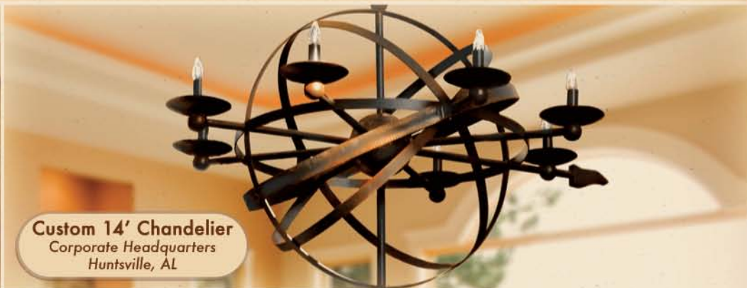
Custom 14' Chandelier Corporate Headquarters Huntsville, AL