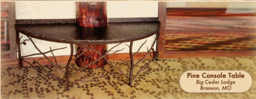
Pine Console Table Big Cedar Lodge Branson, MO