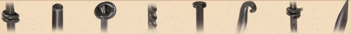
Wrap Blunt Knot Twist Cap Curl Organic Wrap Taper

Terminations - The end of every length of iron provides an opportunity for adornment. Terminations are limited only by the imagination, and help display the craftsmanship of a genuine forged iron piece.