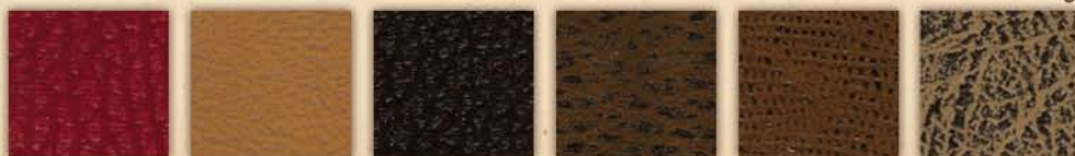
Scarlet Distressed Tan Black Brown Lizard Brown Distressed Brown