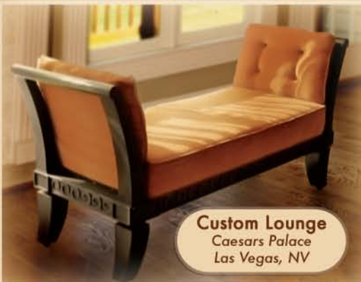
Custom Lounge Caesars Palace Las Vegas, NV