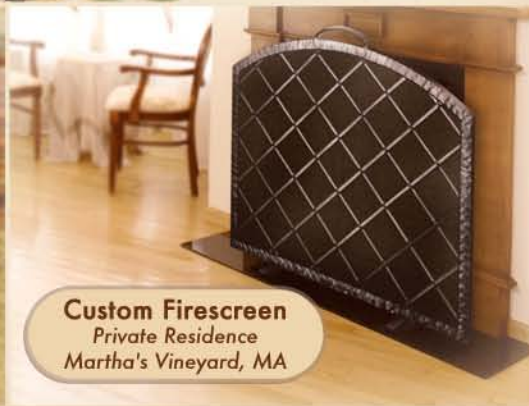
Custom Firescreen Private Residence Martha's Vineyard, MA