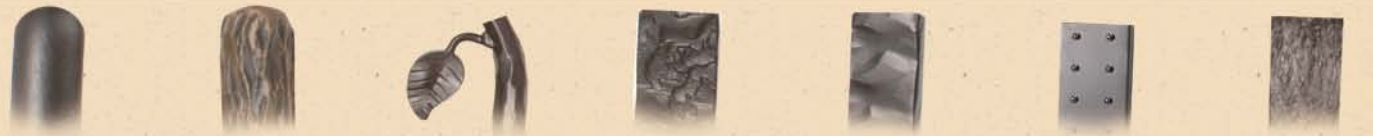
Smooth Pine Sassafras Smithy Forest Hill Rivet Cedarvale

Textures - Over the years Stone County has provided hundreds of texture variations. The following represents several popular looks that help shape the character of the piece.