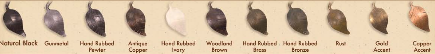
Natural Black Gunmetal Hand Rubbed Pewter Antique Copper Hand Rubbed Ivory Woodland Brown Hand Rubbed Brass Hand Rubbed Bronze Rust Gold Accent Copper Accent

Finishes - The following selection of finishes and accents typically meet most finishing requirements. However, we will always try to accommodate other special finishing requests beyond our standard palette.