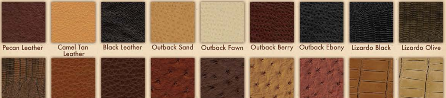
Pecan Leather Camel Tan Leather Black Leather Outback Sand Outback Fawn Outback Berry Outback Ebony Lizardo Black Lizardo Olive Lizardo Umber Rustico Clove Rustico Coco Emu Sedona Emu Espresso Emu Wheat Emu Cherry Everglade Saddle Everglade Sand

Upholstery - We have custom upholstery capabilities which utilize our leathers, faux leathers and fabrics... or we can produce a piece using material provided by you.